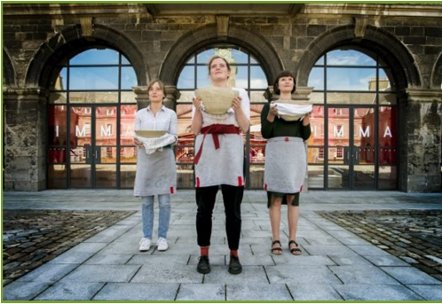
The Fairland Collective

WHAT worked closely with Age & Opportunity/ Bealtaine Festival to develop an artist residency within a care setting, specialising in caring for older people with dementia and providing an opportunity for creative engagement over the course of a number of months. WHAT was involved in designing the residency brief and in the selection of the artists, The Fairland Collective, who worked with residents at St. Joseph's Community, Shankill, Co. Dublin.