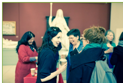
Check Up, Check In.

In April 2018, WHAT, under artsandhealth.ie , hosted the third Arts and Health Check Up, Check In at Crawford Art Gallery, Cork, in partnership with Create, the national development agency for collaborative arts, with local partners Uillinn West Cork Arts Centre, Crawford Art Gallery, Cork Kerry Community Healthcare Health & Wellbeing and Niche Community Health Project. Arts and Health Check Up, Check In is funded by the Arts Council and the HSE.