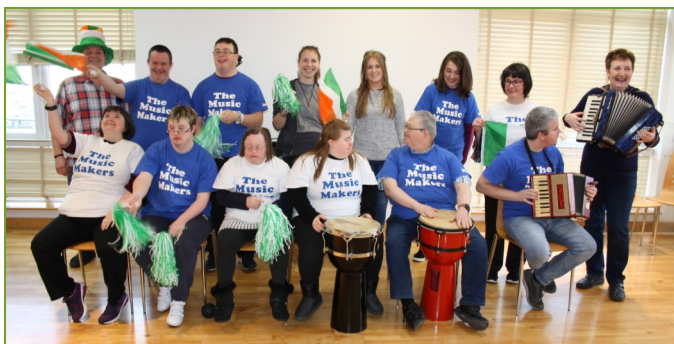
The Music Makers