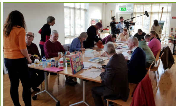
Open Studio participants being filmed by Virgin Media for the National Lottery Good Causes Awards.