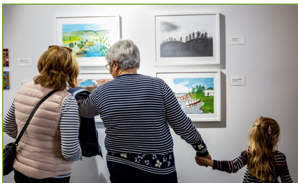
This is WHAT we're all about exhibition.

Hotel, Carlow in June. lontas was supported by a steering group comprising representation from healthcare professionals, the voluntary sector (Shine), service users and WHAT.