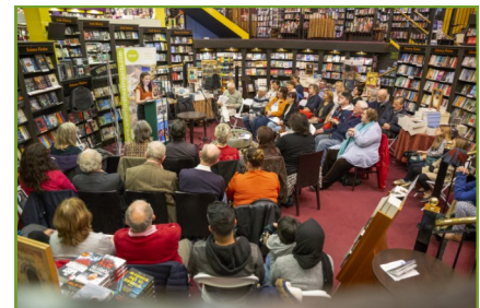
We haven't had an earthquake lately...

- Welly Tales, a special storytelling session in the Paediatric Ward of UHW, facilitated in collaboration with Ardkeen Library.