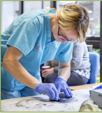
Print a Gift Workshop.

beautiful large-scale stars were created by workshop participants and symbolised positivity and hope.