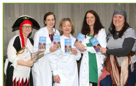
Well Festival launch.

In October, WHAT joined with festival partners Garter Lane Arts Centre and Waterford City and County Libraries to present a fun, accessible, multidisciplinary festival to champion the benefits of participation in the arts with a wide-ranging programme of 49 innovative events for all ages across all artforms. 46 of the 49 events were free. Events curated by WHAT for Well 2018 included: