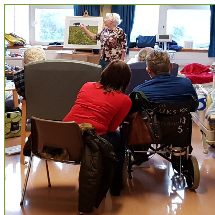
Open Gallery.

In each session, three paintings from the hospital art collection are discussed by the participants. These sessions are all about the participants making observations, describing, building connections and enjoying art together.