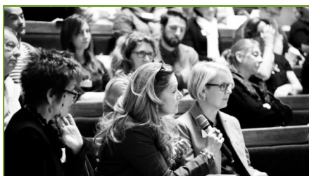
Check Up, Check In.

Participants at Check Up Check In 2018 also had the opportunity to learn about plans to develop a framework for strategic partnership between the Arts Council and the HSE, the national statutory bodies with responsibility for the arts and health, alongside a presentation from Creative Ireland. The event was sold out and documented feedback from the day was universally positive. A short video documenting the event was disseminated via artsandhealth.ie .